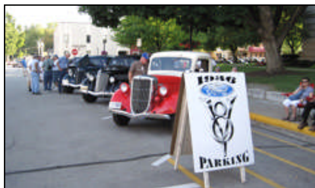
A special section for all the '36s that were at the Meet