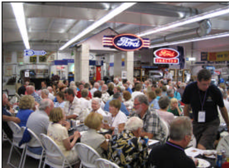
The joint was jumpin' as 185 folks gathered for The Night at the Museum on Wednesday. Not officially part of the CNM, but most folks in attendance were there for the Meet as well.

The 2011 Central National Meet in Auburn, Indiana, is over, and the four hosting regional groups—Northwest Indiana 69, Ohio 141, Indiana 56, and Auburn Blue Ovals 169—want you to return and visit Auburn and the Foundation museum when you are in the area. Memorabilia as well as vehicles will continue to be added.