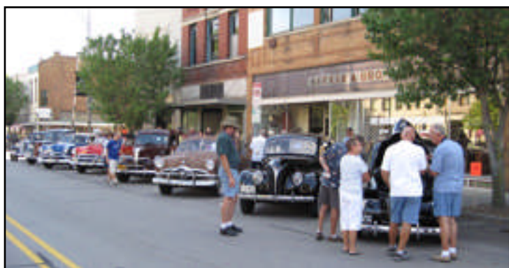
And what would a trip to Auburn be without a Town Square Cruise-in?