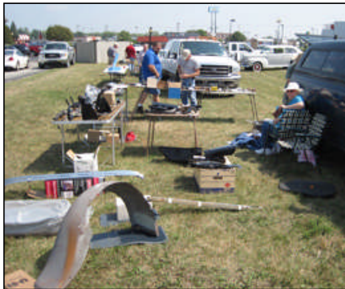
What would a National Meet be without the Swap Meet?