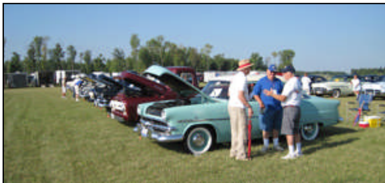
Part of the Concourse on Judging Day